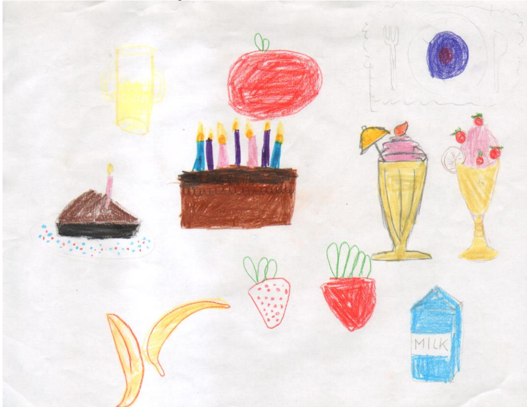
The perfect Sunday snack, by Isabella (Primary 2)