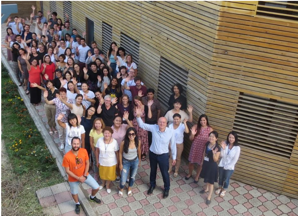
BIS Staff awaiting your return beside the new Makerspace and Music Room in the annex.

As an international school we always have some turnover in both students and staff every summer as people move elsewhere and we welcome several new staff this summer. These team members bring with them a diverse skill set and an abundance of experience. Photos and bios of all the staff will be available on our website soon. In the meantime, you can see the team in our group picture below! From the next edition of Voices, there will also be a feature called 'New Faces of BIS' where, each week, you will get to know a new member of the team in more detail.